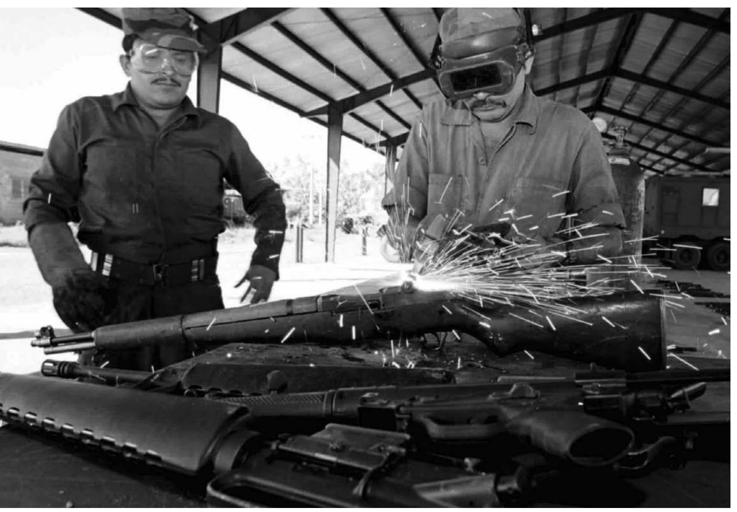
Salvadoran soldiers destroy M-16 rifles at a military base west of San Salvador.

Nevertheless, the FMLN leadership maintained significant reservations about the nature of military reform until 2004, when they concluded that the military was able to play a permanent role in a democratic society.