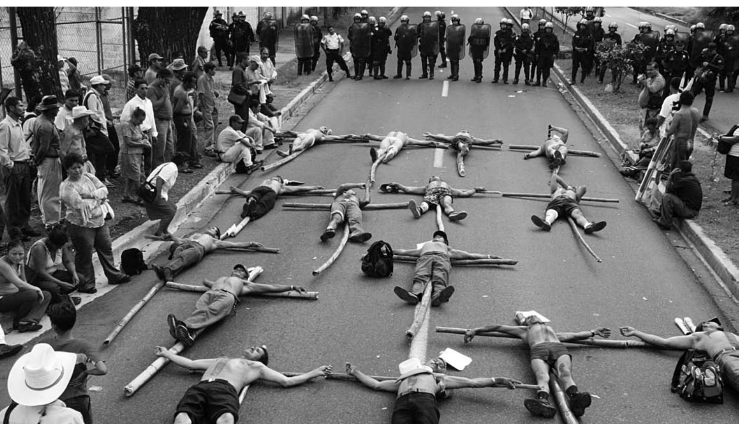
People wounded in El Salvador's civil war take part in a demonstration to demand land, medical treatment and help with reintegrating into society. 11 October 2006.

lamented, was that foreign donors mostly granted funds for the reintegration of guerrillas.85 The armed forces for their part had to improvise on a number of issues, and lacked the internal capacity and flexibility to move as fast as the circumstances required to find ways to relocate and support soldiers often uprooted from their original communities.