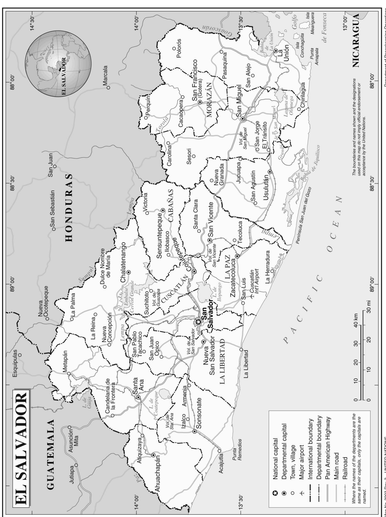
Map No. 3903 Rev. 3 UNITED NATIONS May 2004